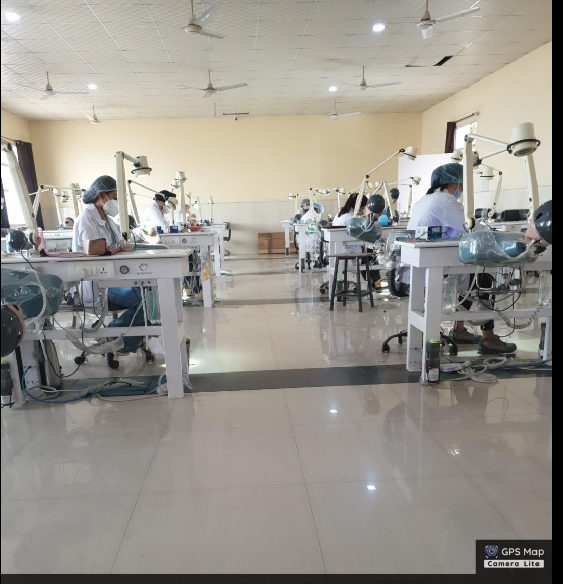
MQJC+683, Green Avenue, Faridkot, Punjab 151203, India